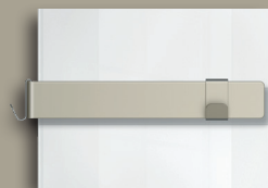
*bathrobe hooks are sold separately