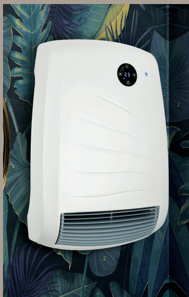
BALI model in white color