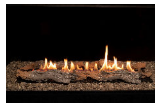
ceramic logs (installed around the burner)